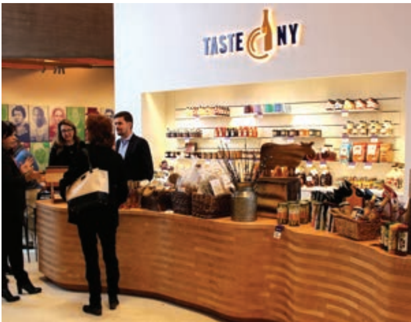
Visitors in the Taste NY Auburn Market in the NYS Equal Rights Heritage Center

Prospective vendors who are interested in selling local products in the market are encouraged to contact Heather Ward, Manager, Taste NY Market at the NYS Equal Rights Heritage Center, at hab27@cornell.edu or 607-229-3650 for more information.☀