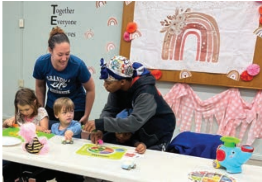
An FVRx class at Cayuga Community Action Program (CAP) Head Start

CCE Cayuga's Food & Nutrition Program has established strong partnerships with local food banks, farmers' markets, community organizations, schools, and health organizations -- be sure to look for Becky delivering programs at these sites in Cayuga County! ☀