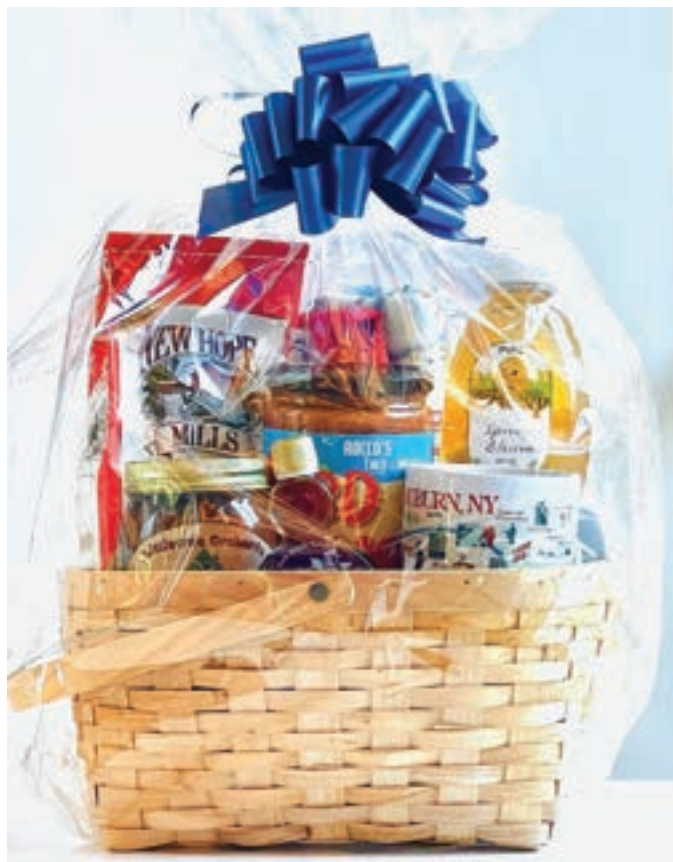
Gift baskets filled with local products have become a new sales opportunity at the Taste NY Auburn Market.

Peak sales at the Market occur during summer months and near the holidays of Memorial Day, Labor Day, Thanksgiving and Christmas. The popular Auburn Downtown Outdoor Markets, held on Saturdays from late June through August, draw consumers from across Cayuga County and give local growers and producers and opportunity to reach the public directly with