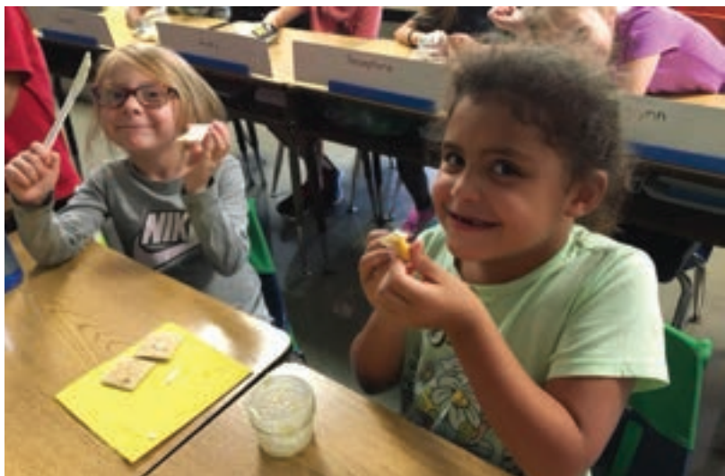
Smiling girls enjoy tasting butter they just made at a DITC Program