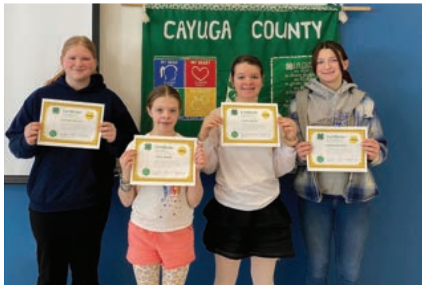
Junior and Senior Public Presentations participants