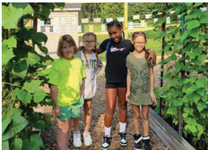
Herman Avenue Elementary students learn about nutrition in their garden

Our SNAP-Ed program used the "Growing Healthy Kids" gardening nutrition curriculum with 91 youth at Booker T. Washington Community Center Summer Day Camp in their newly renovated garden. ☀